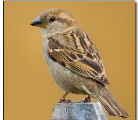
Female House Sparrow

Their backs are noticeably striped with buff, black, and brown.