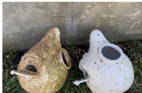
Before and after cleaning the gourds. Note the barnacles.

With the help of PMCA we have been able to order the needed parts; ground stakes, gourds, brackets, etc. We are trying to get all the known colonies (public and private) in Cape Coral back up in time for the martins’ return. Cape Coral is one of the first places the martins return to. Last year the first birds were seen on January 8th. PMCA has also helped us by sharing our Facebook Go Fund me page on their Facebook page. If you would like to contribute, go to