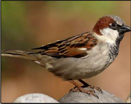
Male House Sparrow

Male House Sparrows are brightly colored birds with gray heads, white cheeks, a black bib, and rufous neck.