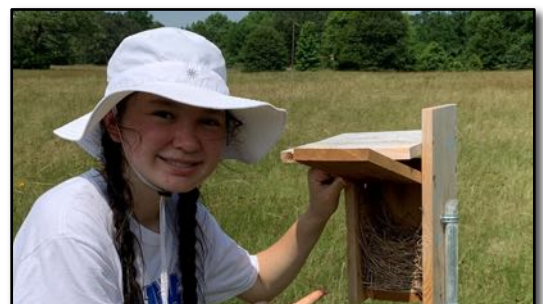
Success, bluebird families in 2 nestboxes!