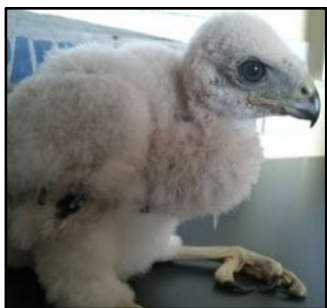
Cooper's Hawk nestling