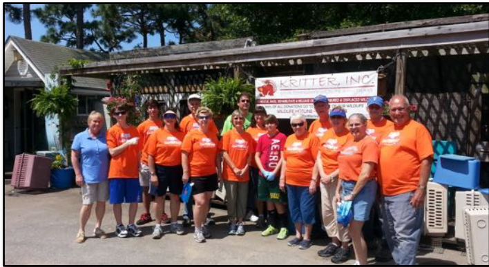
Staff and volunteers of Kritters Inc. Wildlife Sanctuary

Sadly, in June, 2017, after an amazing decade caring for 1000s upon 1000s of wildlife, 25 full time volunteers, 30+ cages of various sizes, an Education building where we taught classes on everything we learned, brought in