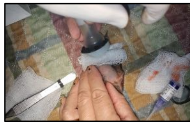
Surgery in progress.

A volunteer and I traveled to Ft Worth, Texas to attend Bat World's 4-day hands-on training class for insectivore bats, returned the next year for another 4 days of intensive medical and surgical treatment..