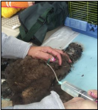
Treating a Bald Eagle

flight cage was a gamechanger and updated my Permit status to include Bald Eagle rehab.