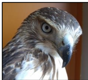
Maverick, a Red-tailed Hawk

I spent a week with a master falconer – I specialize in Raptors and needed experience handling, tethering, making jesses, feeding juveniles, flight training, housing, specific gloves for different specie and properly displaying these incredible creatures for educational programs, knowledge of wing spans and flight feathers versus tail feathers, primaries and secondaries, up lift and down, a lifetime of study, a passion to protect and heal – it never leaves your heart.