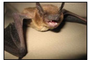
Evening Bat displays teeth

I spent a week with a master falconer – I specialize in Raptors and needed experience handling, tethering, making jesses, feeding juveniles, flight training, housing, specific gloves for different specie and properly displaying these incredible creatures for educational programs, knowledge of wing spans and flight feathers versus tail feathers, primaries and secondaries, up lift and down, a lifetime of study, a passion to protect and heal – it never leaves your heart.