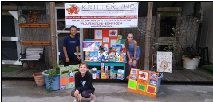
Local high school clubs volunteer to help with fundraising.

Our first Bald Eagle admit came with a donation check for $5000! Many grade schoolers and adults were able to view him up close, several volunteers got the opportunity to hold him, tethered on a leash. 1000s of photos were taken of him and on his release party, more donations were collected both monetary and materially, our Master Gardener group lined our driveway with Bird of Paradise plants ( Strelitzia ) which is the flower of freedom – we used this release party as our “open house” ground breaking for the Chamber of Commerce organization which proved to be a tremendous avenue to gain volunteers for special events. Recognized by the school counselors at our local High Schools, students needing volunteer house from disciplinary problems to Beta Club activities, art/science class projects and a multitude of fundraisers.