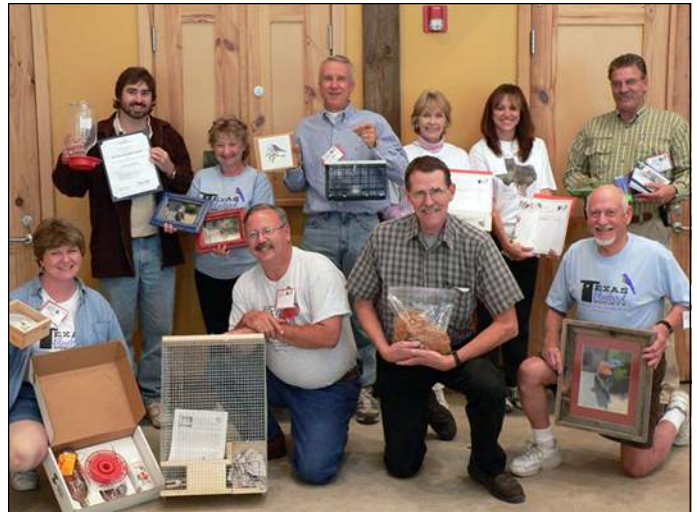
2005 fall auction winners, held Cibolo Nature Center in Boerne.