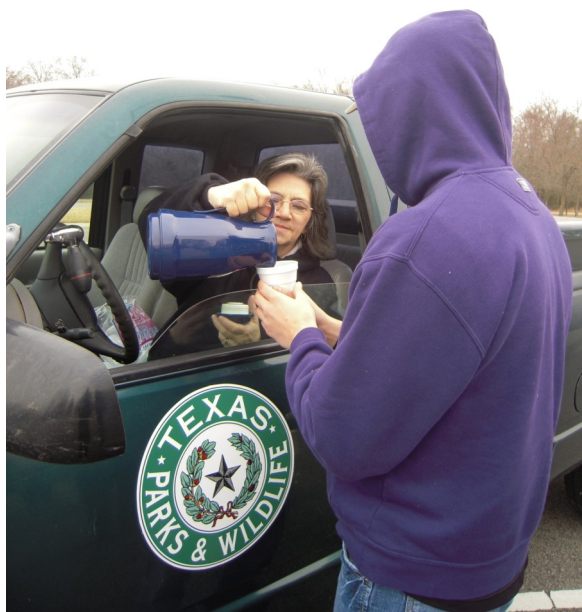
Texas Parks and Wildlife kept the project running with hot coffee

It was still dark at 7:00 on the morning of January 24 as I drove east from Dallas on Interstate 20 towards Lake Tawakoni State Park. The temperature was 34 degrees and the wind was blowing in hard from the north. Some of the gusts were 30 miles per hour. Trash and tree branches blew across the deserted highway. Out of nowhere a lone coyote appeared in my headlights only to disappear quickly, like a hallucination.