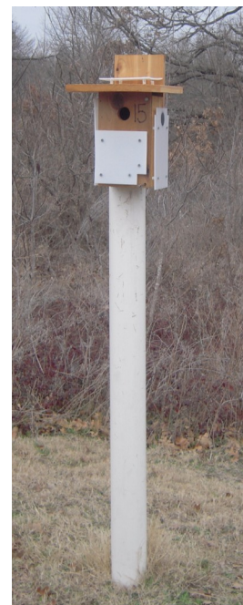
Completed nesting box with heat shields and faux holes designed and built by Troop 332 in Kaufman, Texas.

So with character and Bluebird nesting box building ahead of us, we set out. Most of the old wooden houses were in sad shape—the once tiny holes had been pecked wider and used by larger birds. The roofs of many were split open. As we approached one of