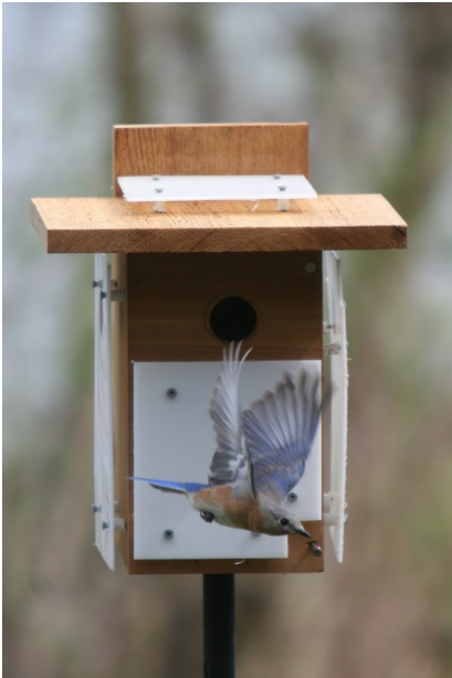
A female Bluebird decides to make the new nesting box her home.

the old nesting boxes near a clump of trees, a male Bluebird flew out and landed on the wire above our