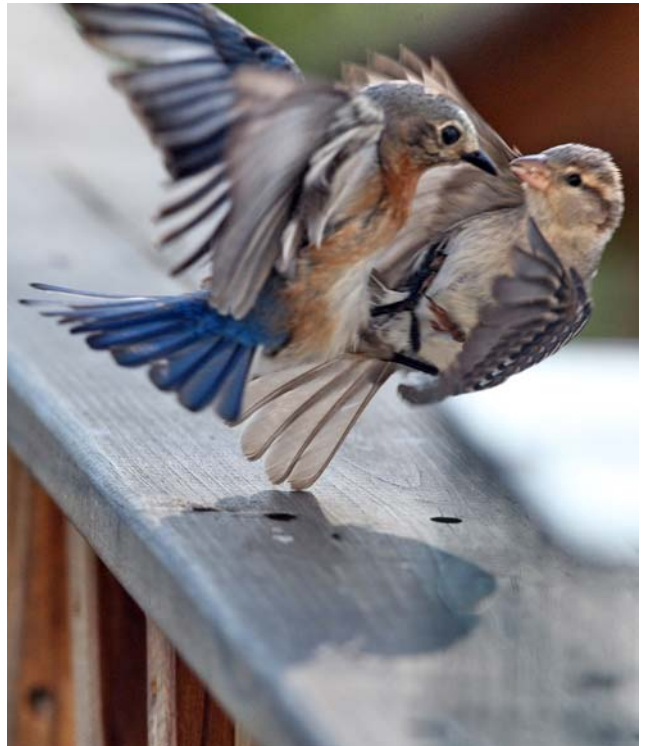
A recent post on the Bluebird Forum of Gardenweb reported House Sparrow teamwork - the male HOSP chased the male bluebird while the female went into the box and killed the female bluebird.