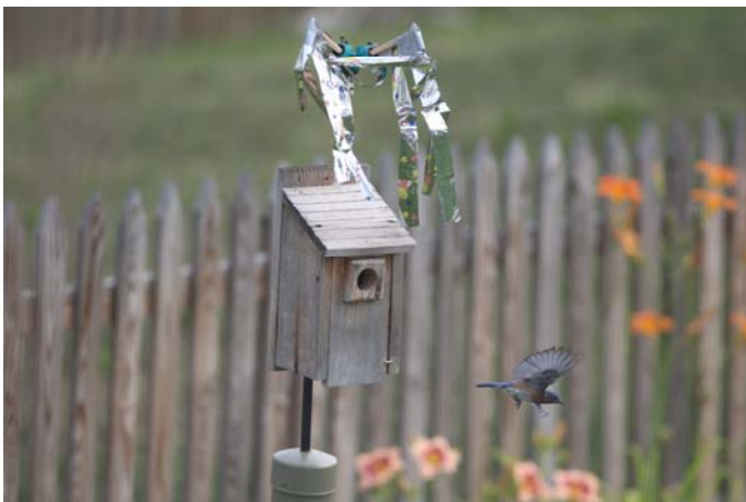
A bove: Homemade Sparrow Spooker

House Sparrows have the ability to nest in many, many locations, yet they will often deprive our native birds of the only sort of nesting niche they have available to them. Likewise, European Starlings take over virtually every Red-bellied Woodpecker nest in my neighborhood. The woodpeckers works months making the nests, then the more aggressive starlings push them out. House Sparrows and European Starlings are not evil birds at all...they just are not native to North America and they should not been here. Nature provided them a niche in Europe and man they cause many problems for the birds that are supposed to be here. This is just another example of why it's not nice to mess with Mother Nature!